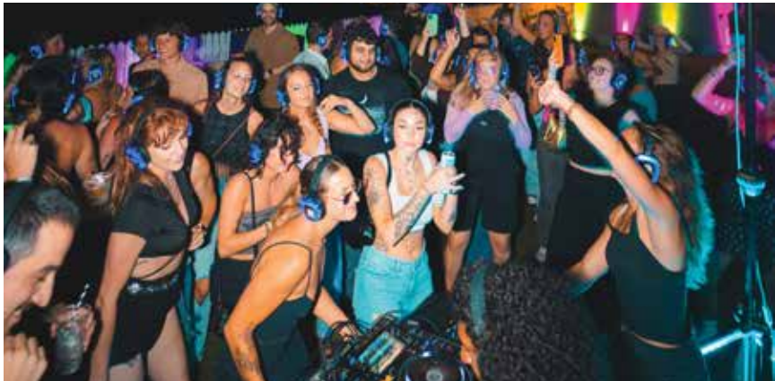
Cover and additional photo via: Space of Balance (Jacob)